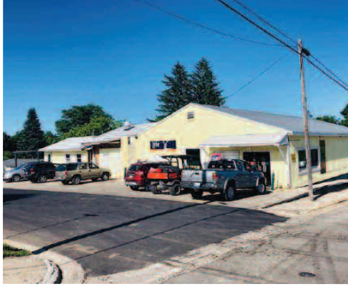
6508 CENTER STREET • ELLSWORTH

Your dream of living close to Lake Charlevoix and the School are about to come true. This 4 bedroom home has been freshly done with touches of old and new. There are original hardwood floors and fresh paint with new and up to date bathroom. Walking distance to town and all the Freedom Festival has to offer. MLS #459049. $149,900