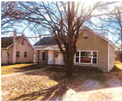
308 BOWEN STREET • EAST JORDAN

This one is a charmer... 2 Bedroom 1 Bath, new carpet and fresh paint, close to town and all that Lake Charlevoix has to offer, fishing, boating and more. Call for your personal tour. MLS #457203. $65,900