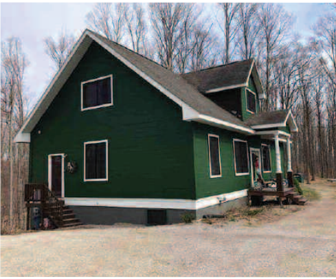
2755 JORDAN HILLS DRIVE • EAST JORDAN